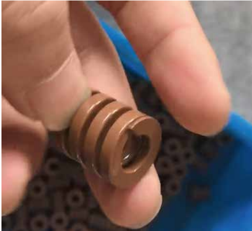
Coating corrosion protection, rust prevention