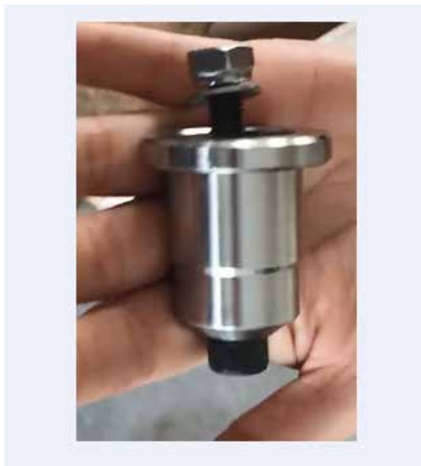
Our magnet is locked from bottom to top