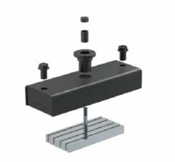
the market is locked from top to bottom