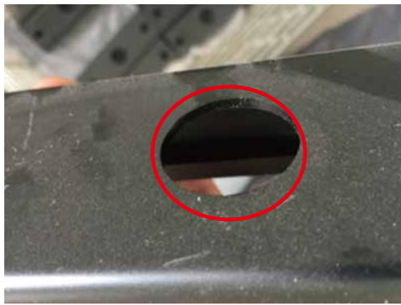
Only one layer of coated metal