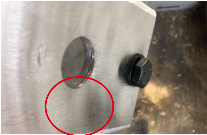
Two-layer coated metal