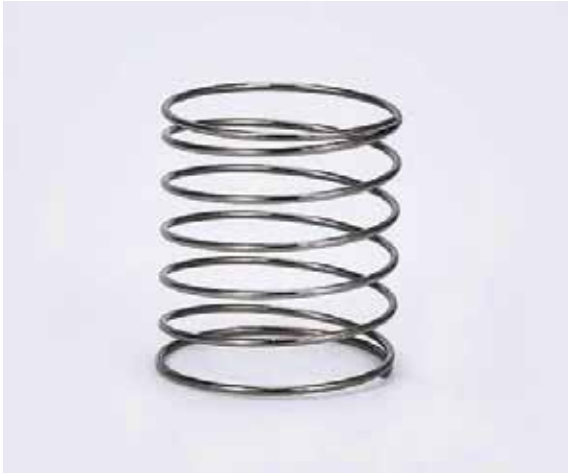
fine, and not Anti-rust treatment